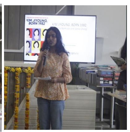
Book talks on "Annual Book Exhibition" organized by MAHEB Library on 20th Oct.22