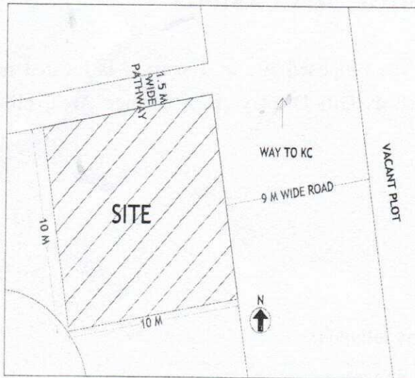
Figure 2: Site plan

NOTE: Site location Plan and Site Detail is not to scale