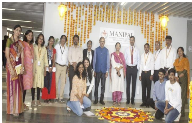
Two-Day Annual Book Exhibition organized by MAHEB Library on 20-21 October 2022