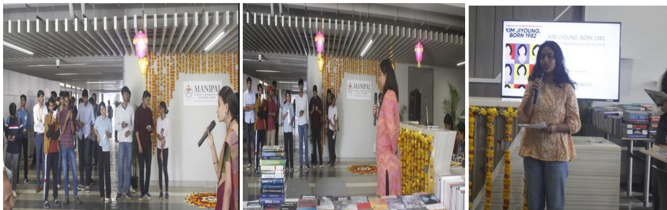
Book talks on "Annual Book Exhibition" organized by MAHEB Library on 20th Oct.22

On the opening day, faculty members and "Literature Club" student members delivered seven book